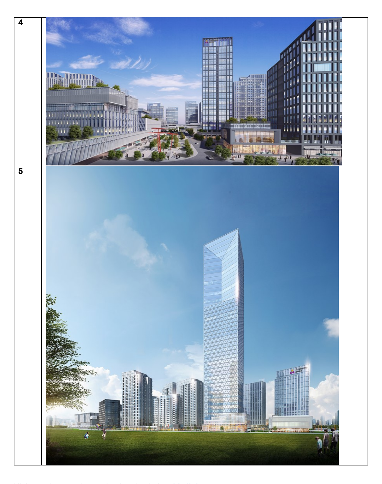
High-res photographs can be downloaded at this link.