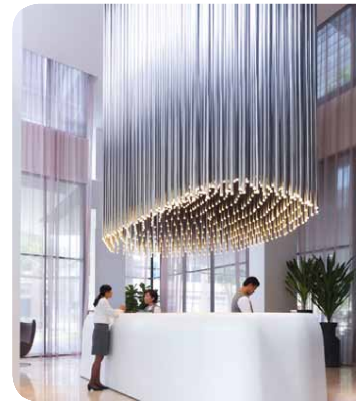
Designed by renowned Italian architect Piero Lissoni, the lofts-only hotel is a chic addition to Singapore's hospitality industry.