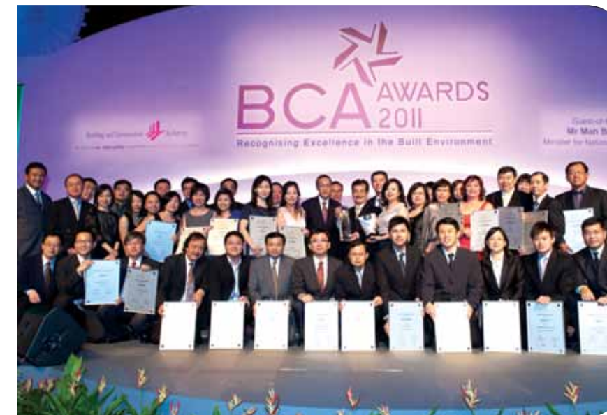
Jubilant CDL staff celebrate the Company's haul of 33 awards, the most for any company to date.

Since the inception of the BCA Green Mark Scheme in 2005, CDL has been extremely supportive of the initiative and is the most decorated Green Mark private developer to date, with 50 Green Mark projects rated Gold and above, including 16 Platinum and 16 Gold Plus projects. In fact, CDL has raised the bar of the Company's "green" standard, with the BCA Green Mark Gold Plus being the minimum standard for all new developments.