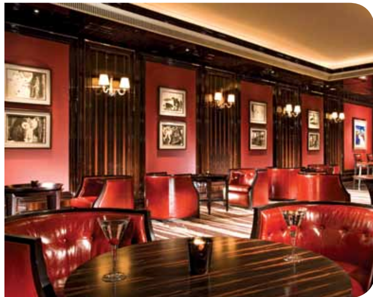
A series of lithograph by Pablo Picasso lines the walls of the warmly decorated Astor Bar, complementing the ambience of affluent splendour and debonair refinement in which to enjoy an extensive range of wines, spirits and Champagnes.

St. Regis Singapore has partnered DBS Insignia Visa to provide lifestyle privileges to their exclusive members.