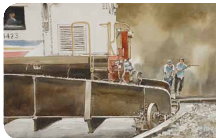
Mr Kwek teamed up with watercolourist, Mr Ong, to capture Tanjong Pagar railway station through various perspectives: rail view (top) and its turntable (right) which is used to manually change the train's direction.

only refreshing perspectives of train stations, railway tracks and activities around them, but also a peek of train operations rarely seen by the public.