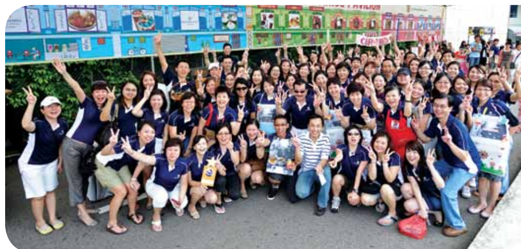
CDL volunteers eager and ever ready to lend support at the Assisi Hospice Charity Fun Day 2011.

With 'Kopitiam' as the theme for the CDL Group of Companies stalls, an array of local delights were sold including tea-leaf eggs, nasi lemak, tau sar piah and keropok, while the hotels dished out their specialties such as M Hotel's famous