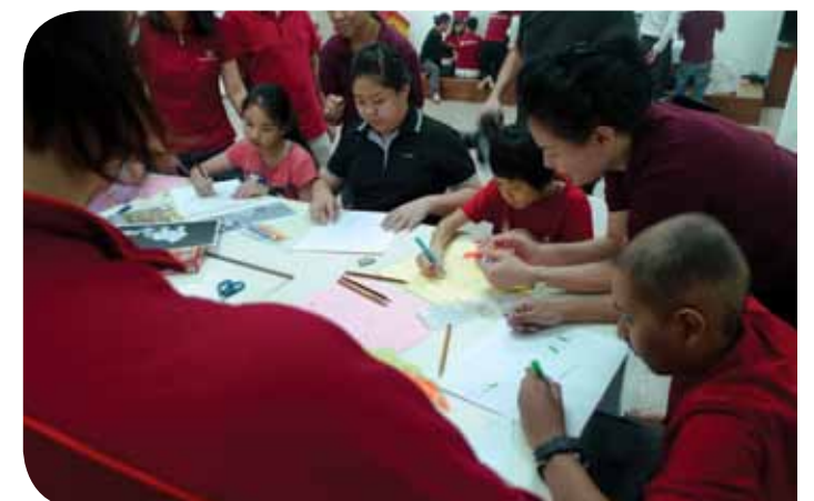
Colourful shadow puppet creations inspired by the children's favourite fairytale and cartoon characters.

While the workshop gave the children an opportunity to use their creativity and learn about how shadow puppets were made, volunteers were deeply touched and inspired by the children who always had big smiles on their faces despite their medical conditions.