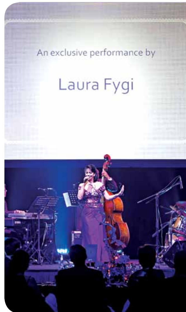
International jazz sensation Laura Fygi enraptured the audience in a private one-night only showcase of sultry numbers like "I Will Wait for You" and "Quiet Nights of Quiet Stars".