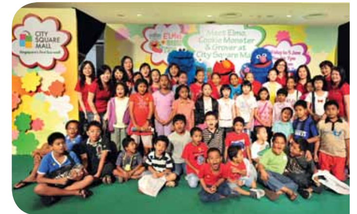
CSC volunteers and the children from Dreams @ Kolam Ayer having fun as they pose with their favourite Sesame Street characters.

On 3 June, 40 children from Dreams @ Kolam Ayer spent a fun-filled evening participating in a Sesame Street colouring and green handicraft workshop held at City Square Mall. Chaperoned by City Sunshine Club (CSC) volunteers, the children were also treated to a delightful Meet & Greet as well as photo-taking session with their favourite characters from Sesame Street such as Elmo and Cookie Monster.