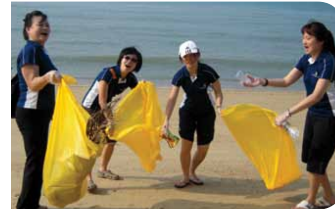
CDL staff celebrating Earth Day in a meaningful way by helping to clean up the beach at East Coast Park.

On this day, 34 CDL volunteers and their families, together with over 800 participants from 14 schools and 2 other corporations took part in a Mass Beach Cleanup held at East Coast Park. The volunteers not only had a great time bonding with each other but more importantly, the event provided a platform for them to renew their commitment towards safeguarding, nurturing and cherishing the environment.