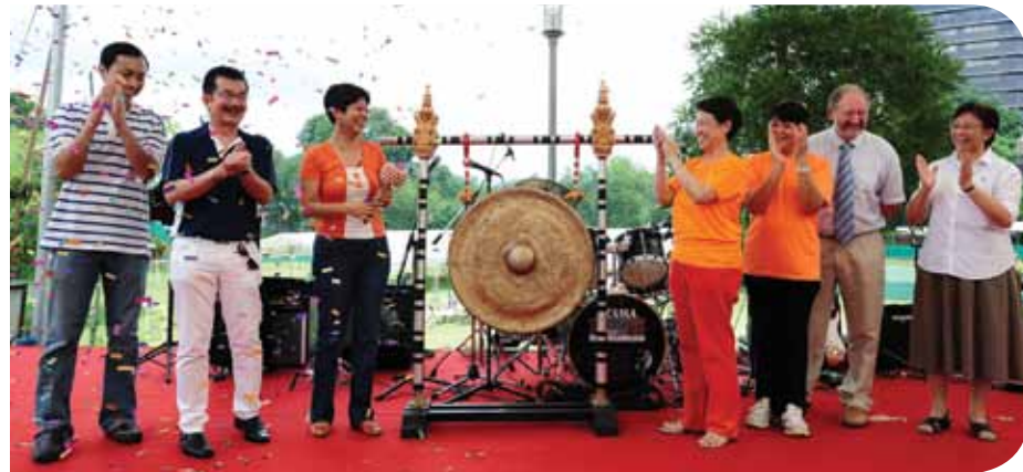
Guest of Honour Ms. Indranee Rajah opened the event by banging on the gong.

chicken pies and curry puffs, Grand Copthorne Waterfront's savoury cream of wild forrest mushroom soup, Copthorne King's refreshing cheng tng and fried mee tai mak and Orchard Hotel's signature cupcakes.