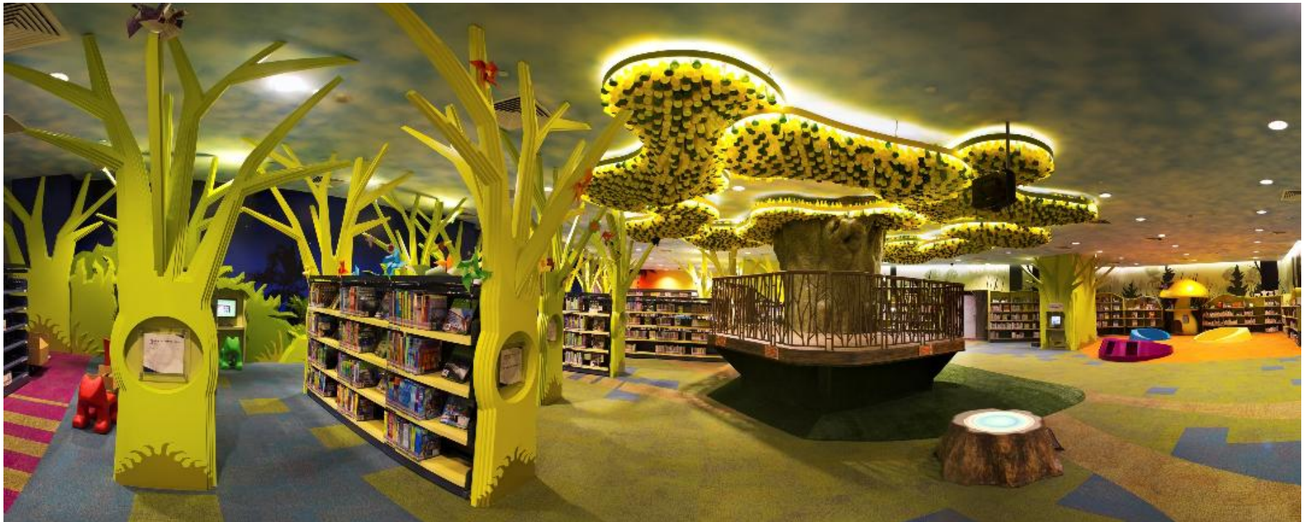
The canopy of the tree house comprises over 3,000 recycled plastic bottles and takes centre stage at “My Tree House”